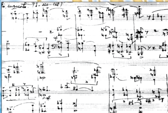
Resurrection opera score

Ján Cikker found the purpose of his life in composing, and through it he attained an honoured position in European musical culture. He died in Bratislava on 21 December 1989. In 2011, he was posthumously awarded the Order of Ľudovít Štúr – First Class.