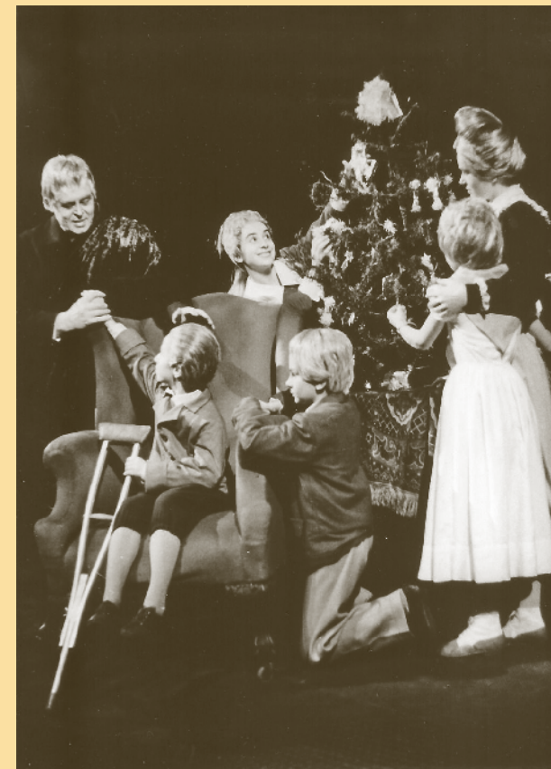
Mister Scrooge's première in Bratislava on 30 November 1963

Cikker's work comprises almost all genres, but his principal area was opera. His main operatic works, including the librettos for all except the first two, were Juro Jánošík, Beg Bajazid, Mister Scrooge, Vzkriesenie (Resurrection), Hra o láske a smrti (A Play about Love and Death), Coriolanus, Rozsudok (Judgement), Obliehanie Bystrice (The Siege of Bystrica), Zo života hmyzu (From the Life of Insects), and the unfinished Antigona. Notable pieces from his works include the piano composition Tatranské potoky (Tatra Streams), the symphonic composition Dramatická fantázia (Dramatic Fantasy), and the oratorium Óda na radosť (Ode to Joy) based on poems by Slovak poet